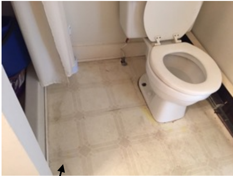
Bathroom - shower to be removed and mop sink installed. Flooring to be repaired and replaced with vinyl wood-look tiles.