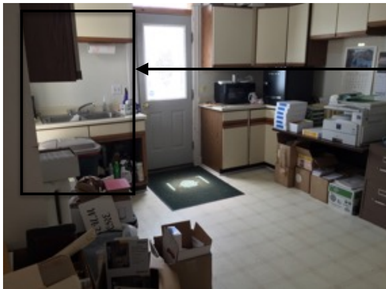
Former kitchen to be remodeled into office space, with closet for storage and new flooring. Copier to be moved into existing office to make room for desk. A restored desk from Earl Young's office is being donated to the Society for the office.