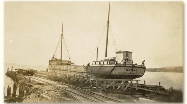
Keuka lumber carrier, circa late 1920s.